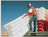
Unload (No cranes needed)

The Triton Barrier, at its 65 kg (140 lb) empty weight, can be easily unloaded and positioned without cranes or heavy equipment. In fact, three workers can deploy over 183 m (600 ft) in just one hour! Deployment involves three simple steps: unload; position and pin; and fill with water using a water truck.