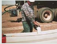
Fill using a water truck.