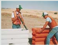
Position and pin.